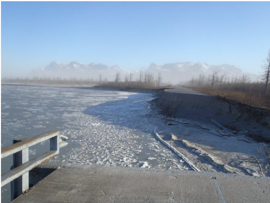
Figure 1 – Bridge 339 looking south August 14, 2012